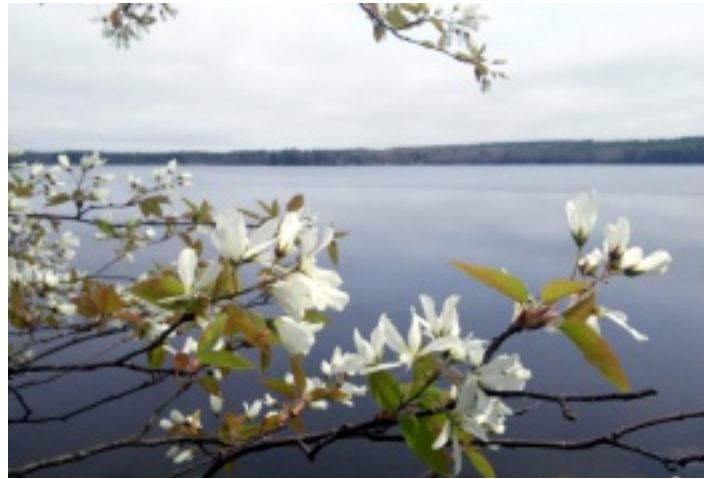
Shad bush, Clary Lake

I took office in the summer of 2011 not just before the water level petition was submitted but before it was even conceived of, and I certainly had no way of knowing then the full extent to which we would be called upon to put committed members of the Association to work under trying and formidable circumstances. It has been a difficult 4 years and you haven't let me down. I, along with the Board have spent many (continued on page 4)