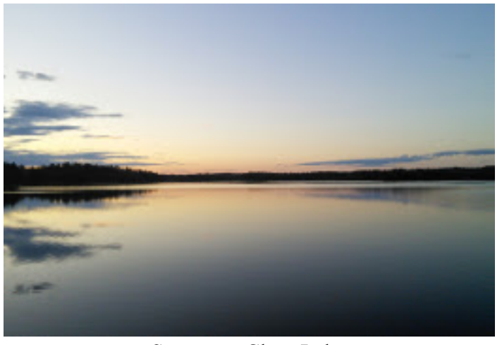
Sunset on Clary Lake

In past years we've been a little lackadaisical about counting votes. Remember, our current bylaws provide for only 1 vote per property. At this year's meeting we're going to implement the "hold up a colored card" method of voting which is now standard practice at Town meetings: the parties associated with a given property will receive one colored card when they arrive and pay their dues (if they haven't already paid them). The card must be held up when voting for the vote to count. Additional information about the meeting and a copy... continued on pg 2