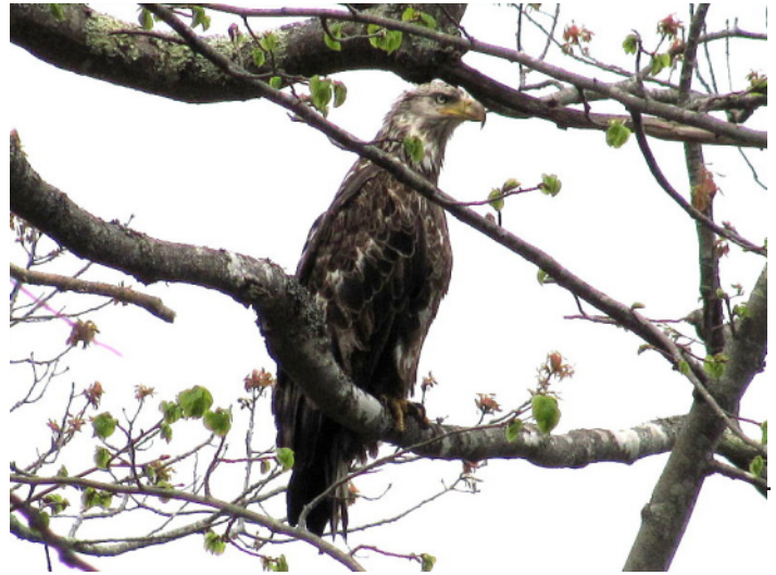
Immature Bald Eagle, Spring 2016