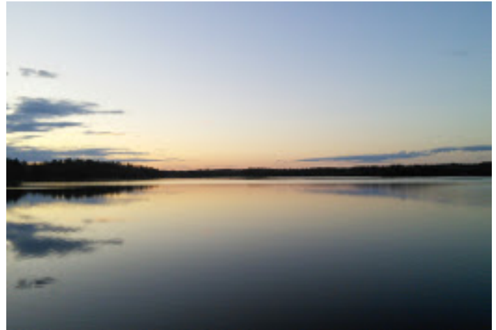
Sunset on Clary Lake

In past years we've been a little lackadaisical about counting votes. Remember, our current bylaws provide for only 1 vote per property. At this year's meeting we're going to implement the "hold up a colored card" method of voting which is now standard practice at Town meetings: the parties associated with a given property will receive one colored card when they arrive and pay their dues (if they haven't already paid them). The card must be held up when voting for the vote to count. Additional information about the meeting and a copy... continued on pg 2